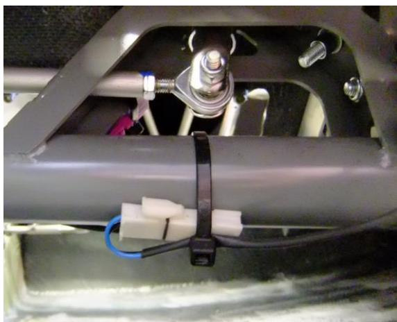
Fig. 1 – Connector